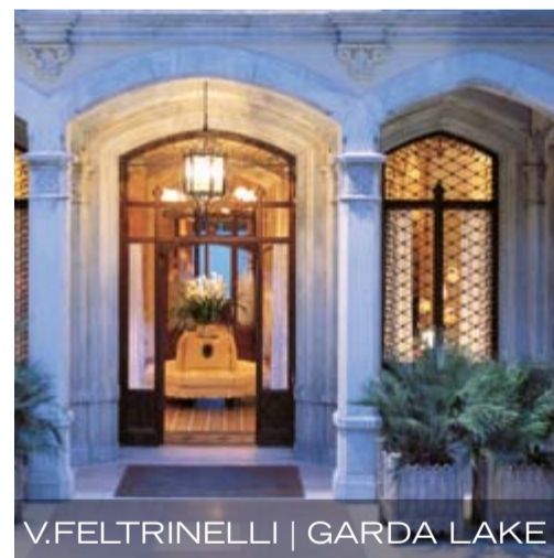
V.FELTRINELLI | GARDA LAKE