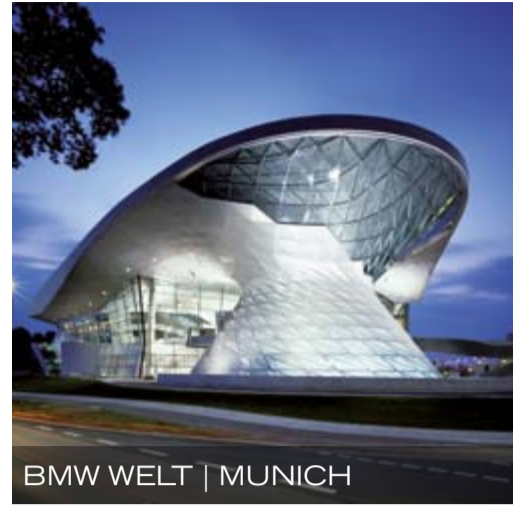
BMW WELT | MUNICH