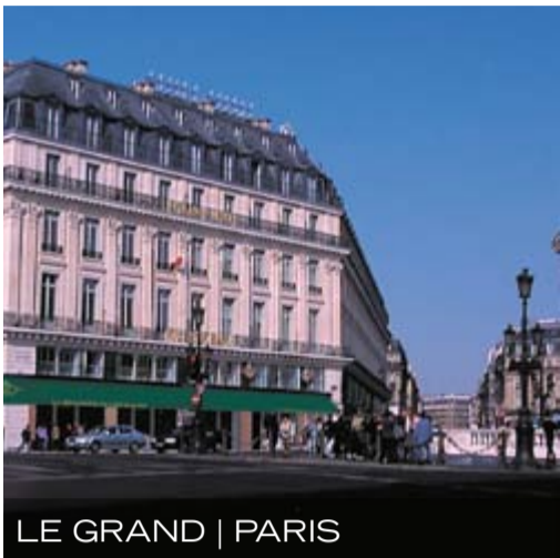
LE GRAND | PARIS