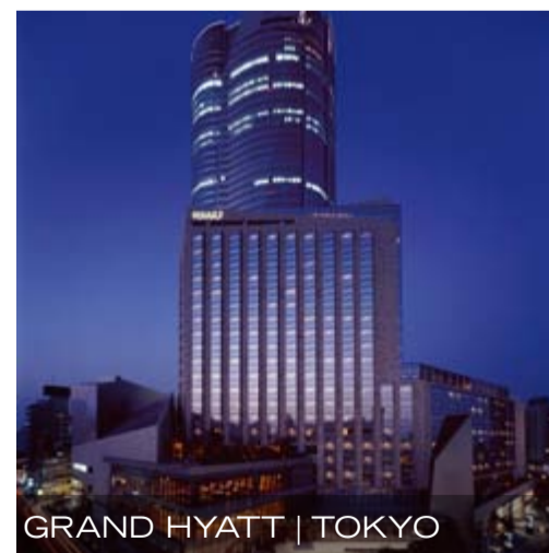
GRAND HYATT | TOKYO