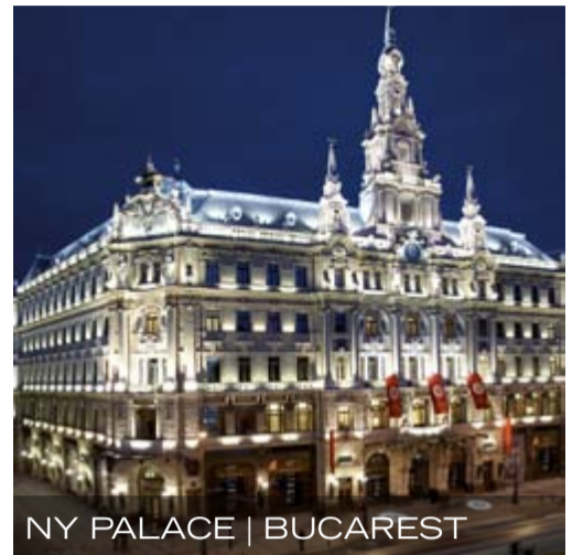
NY PALACE | BUCAREST