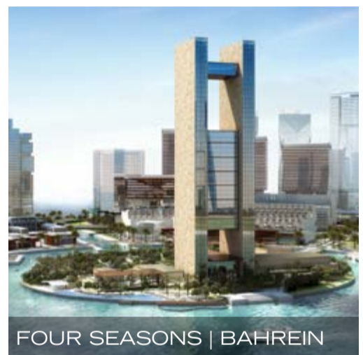
FOUR SEASONS | BAHREIN