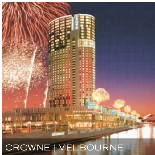
CROWNE | MELBOURNE