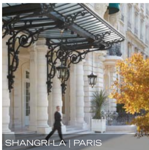
SHANGRI-LA | PARIS