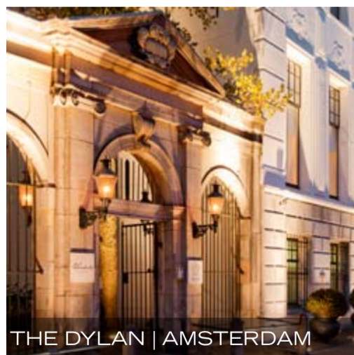
THE DYLAN | AMSTERDAM