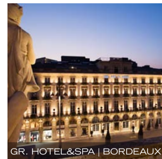
GR. HOTEL&SPA | BORDEAUX