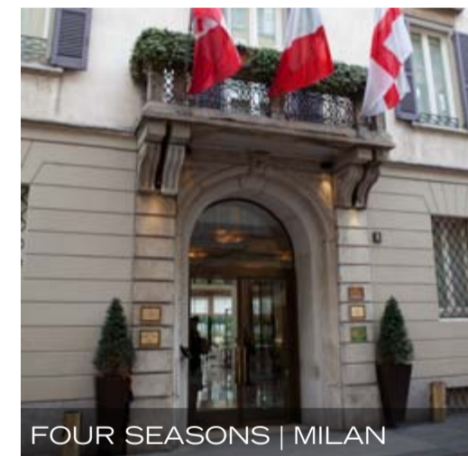
FOUR SEASONS | MILAN