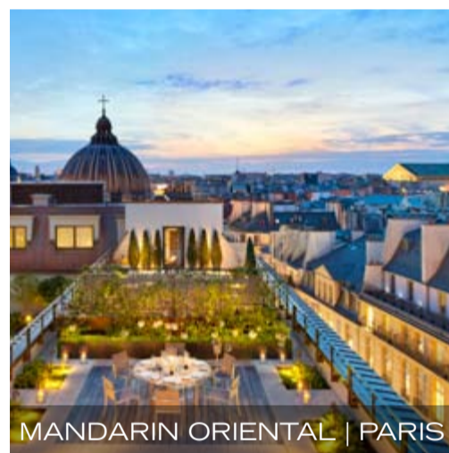
MANDARIN ORIENTAL | PARIS