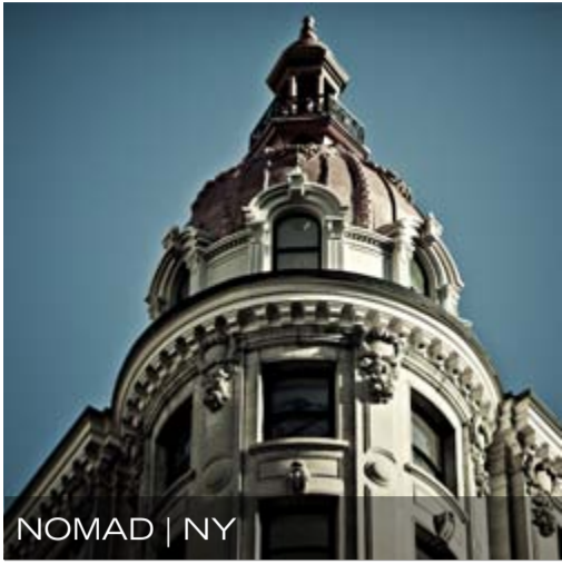
NOMAD | NY