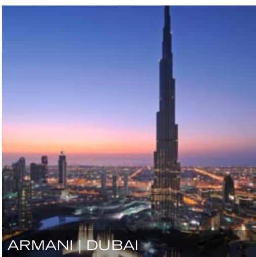
ARMANI | DUBAI