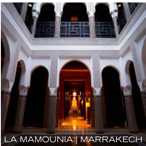
LA MAMOUNIA | MARRAKECH